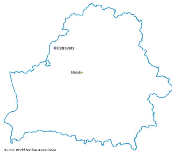
Figure 1 – Planned Nuclear power plant in Belarus